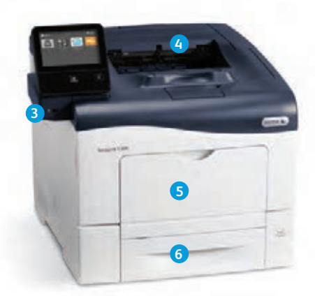
Xerox® VersaLink® C400 Colour Printer Print.