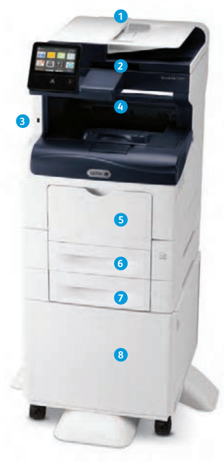
Xerox<sup>®</sup> VersaLink<sup>®</sup> C405 Colour Multifunction Printer Print. Copy. Scan. Fax. Email.